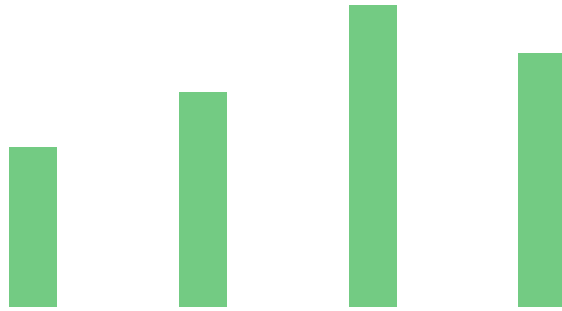
Percent with Annual A c By Race _All Sites_ Chart Audit ( - )